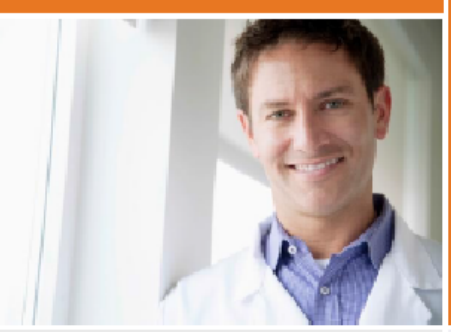
We are here for you. Chat with someone who understands.